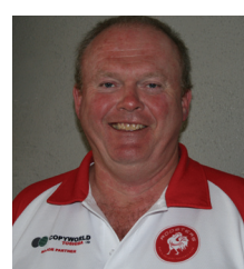
Simon Trenorden *