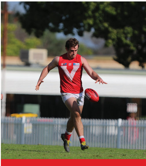
FAIREST & MOST BRILLIANT MAX LOWER